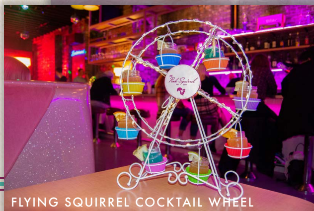
FLYING SQUIRREL COCKTAIL WHEEL