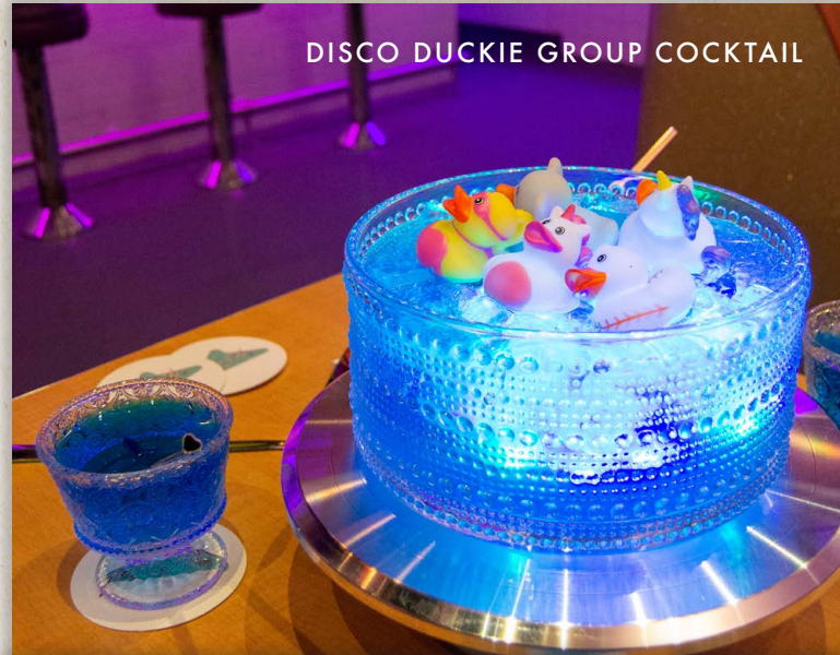
DISCO DUCKIE GROUP COCKTAIL